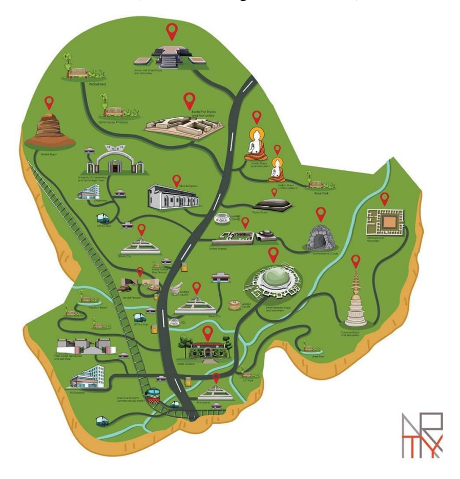
Fig. 1 - 1979 Map of Taxila Valley (Courtesy of UNESCO).

Heritage or cultural tourism is an ambiguous term, according to some of the researchers; it is heritage tourism while others call it cultural and heritage tourism (Cultural & Heritage Tourism Alliance, 2002) CTHA. Culture consists of various aspects of society including material and emotional too whereas, the art, ways of living, literature, and traditions are its main components (UNESCO, 2001). The definition of cultural heritage presented by Nation trust is "traveling to experience the places and activities that authentically represent the stories and people of the past and present. It includes historic, cultural, and natural resources" (Cultural Heritage Tourism, 2005).