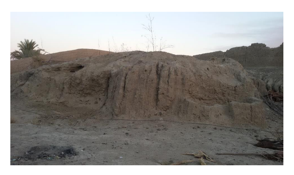
Pl. 1 - Eastern Portion of Khudabadan Damb.