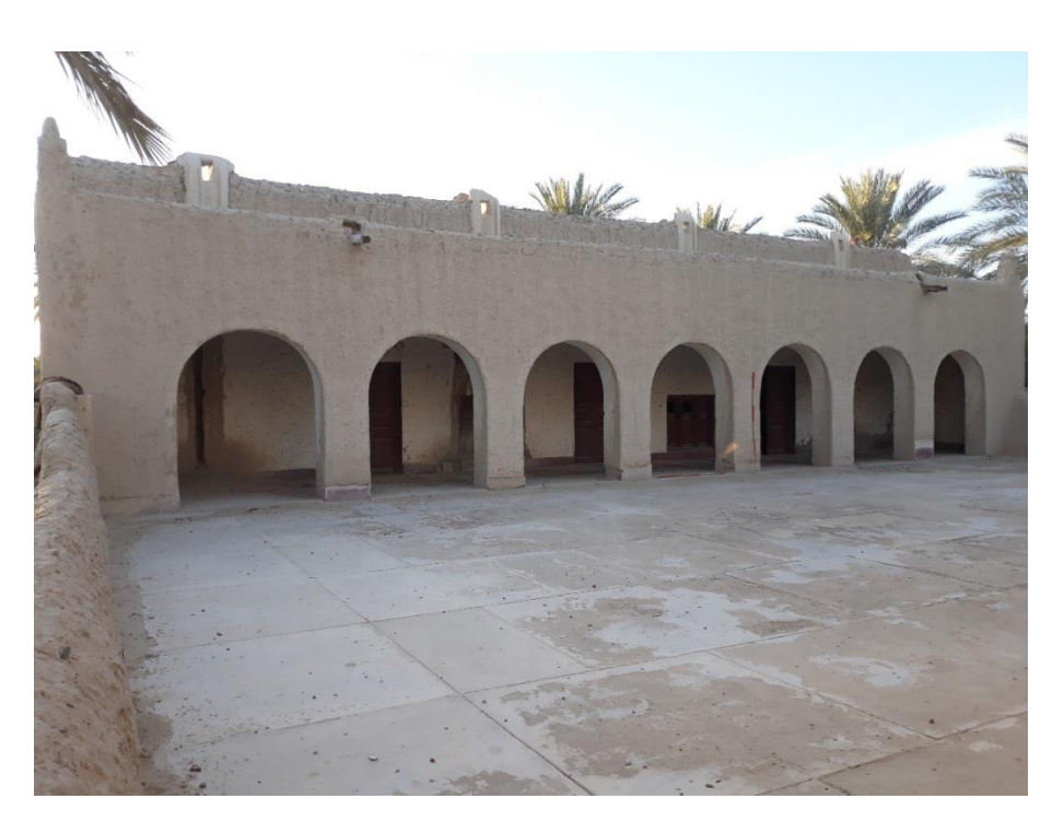
Pl.6 - Bazar Masjid, among Khudabadan Date Grooves (photo by the authors).