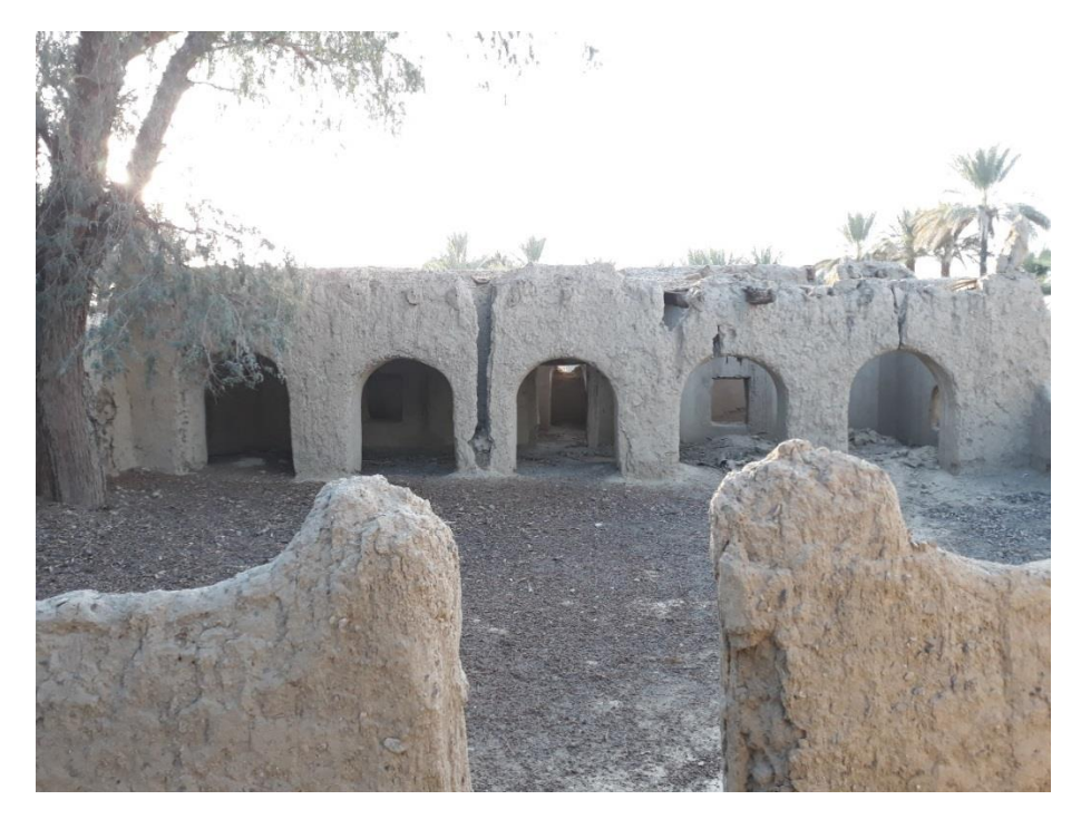
Pl. 7 - Masjid in Khudabadan in Ruins (photo by the authors).