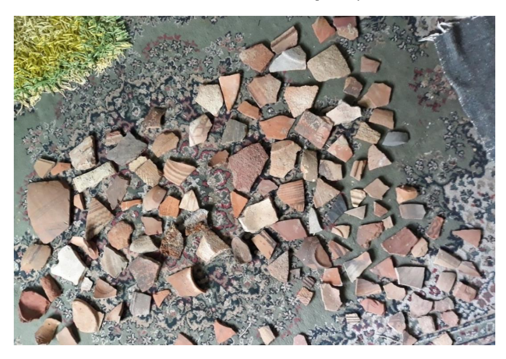
Pl. 2 - Sherds of Khudabadan Damb (photo by the authors).