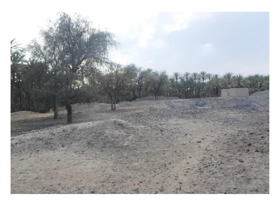
Pl. 3 - The Damaged Singhol Damb.