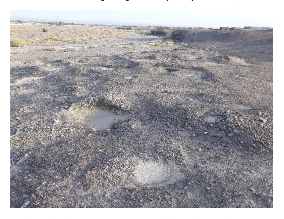
Pl. 4 - Khudabadan/Sarawan Looted Burial Cairns (photo by the authors).