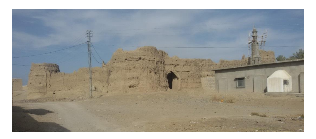
Pl. 5 - Western Part of Khudabadan Damb.