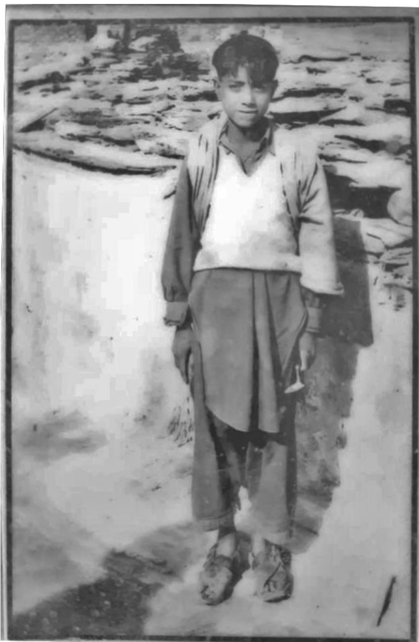
At Butkara I, 1957