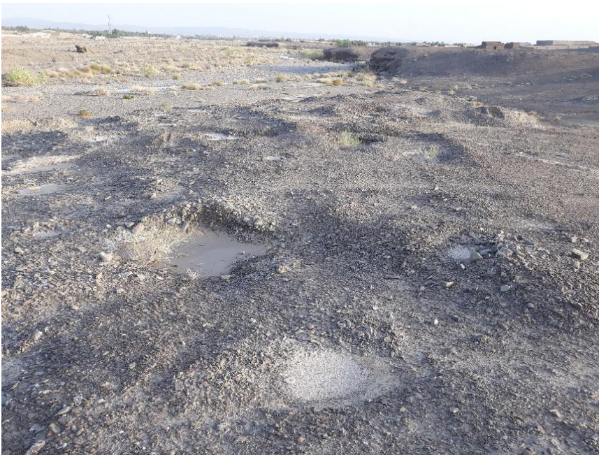
Pl. 4 - Khudabadan/Sarawan Looted Burial Cairns.