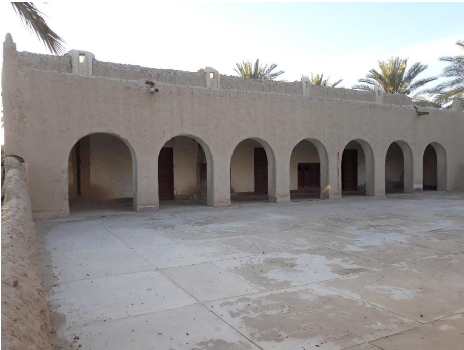
Pl.6 - Bazar Masjid, among Khudabadan Date Grooves (photo by the authors).