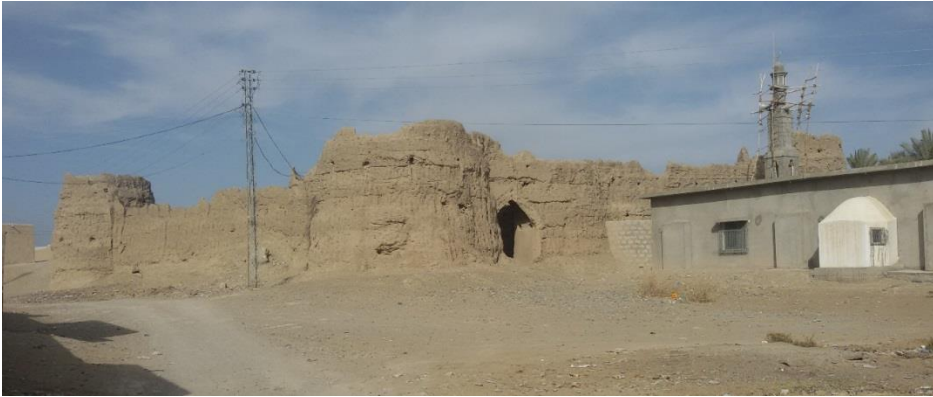
Pl. 5 - Western Part of Khudabadan Damb.