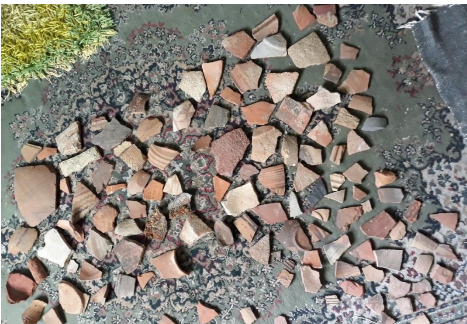
Pl. 2 - Sherds of Khudabadan Dam.