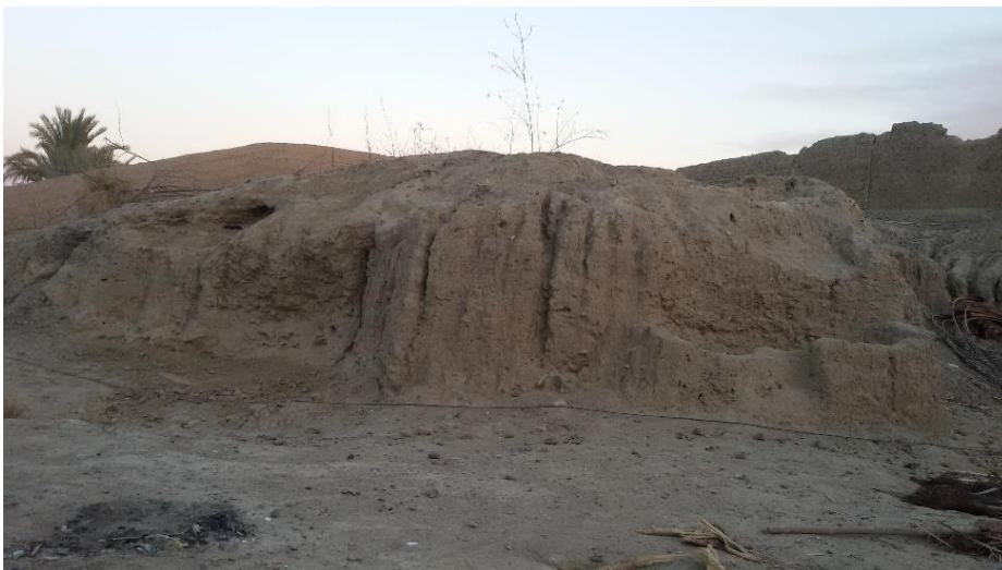
Pl. 1 - Eastern Portion of Khudabadan Dam.