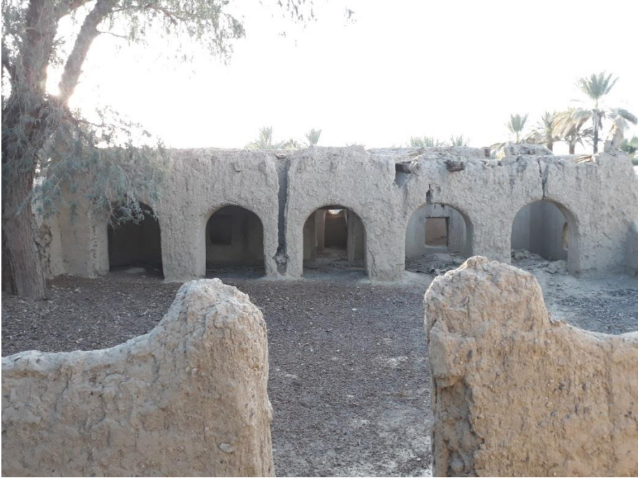
Pl. 7 - Masjid in Khudabadan in Ruins.