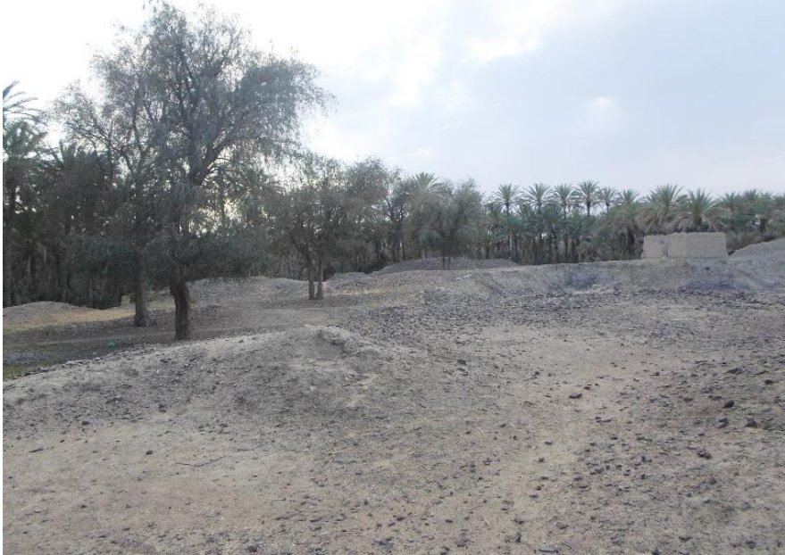
Pl. 3 - The Damaged Singhol Damb (photo by the authors).