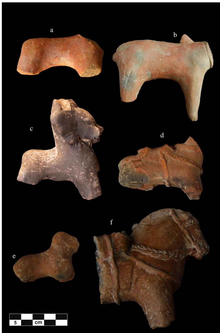
Pl. II - Zoomorphic terracotta figurines; a. TF 0051; b. TF 0862; c. TF 0414; d. TF 0502; e. TF 0500; f. TF 0498.