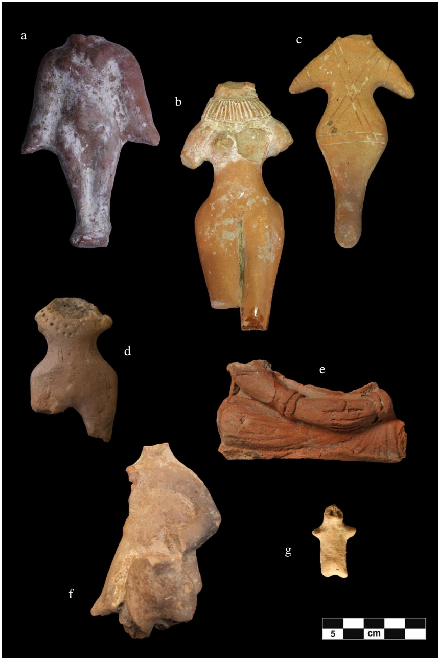
Pl. I – Anthropomorphic terracotta figurines; a. TF 0592; b. TF 0374; c. TF 0407; d. TF 0447; e. TF 0494; f. TF 0383; g. TF 0716.