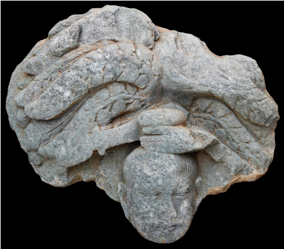
Fig. 1 – SS I 66: Siddhārtha cutting his hair, from Saidu Sharif I (Swat Museum, Saidu Sharif).

The sacred area of Saidu Sharif I is placed chronologically and stylistically in a rather early period of Gandharan art and it could be argued that this iconography reflects an experimental phase.