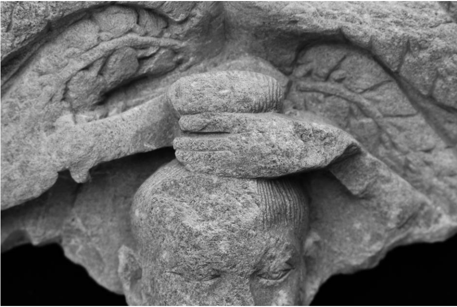
Fig. 4 – SS I 66, detail.