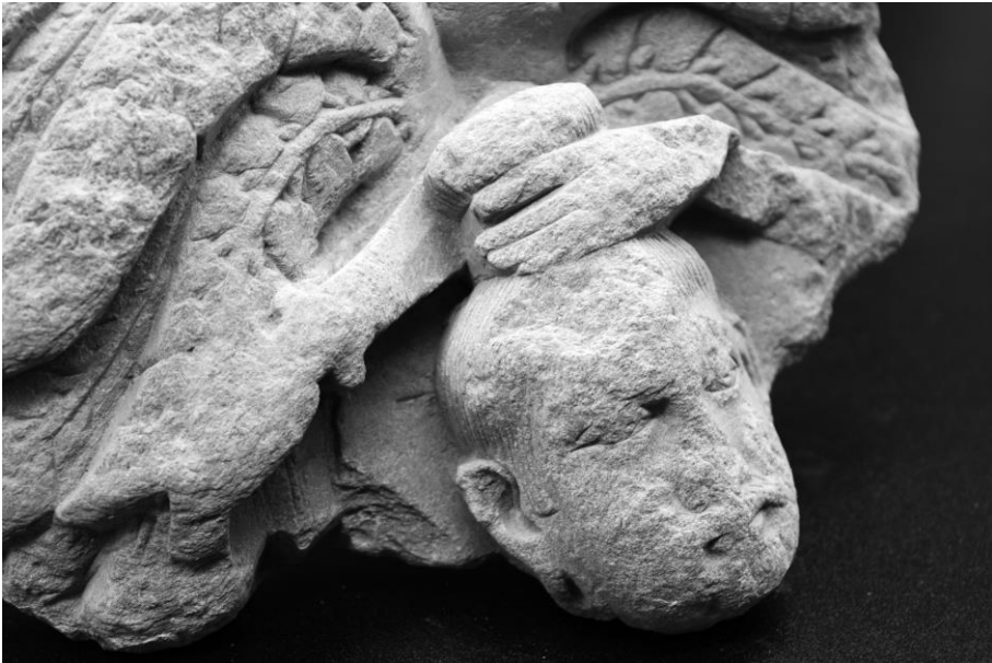
Fig. 3 – SS I 66, detail (photo by the author).

With regards to the rendering of perspective, the head of Siddhārtha is turned a couple of degrees to the left in relation to the plane formed by the back face. The left side of the relief seems more protruding than the right one: the plane of the tree branches to the right seems to be downgraded compared to the branches to the left. In addition, the right ear of Siddhārtha is detached from the nimbus while the left one adheres to it (Fig. 3-5).