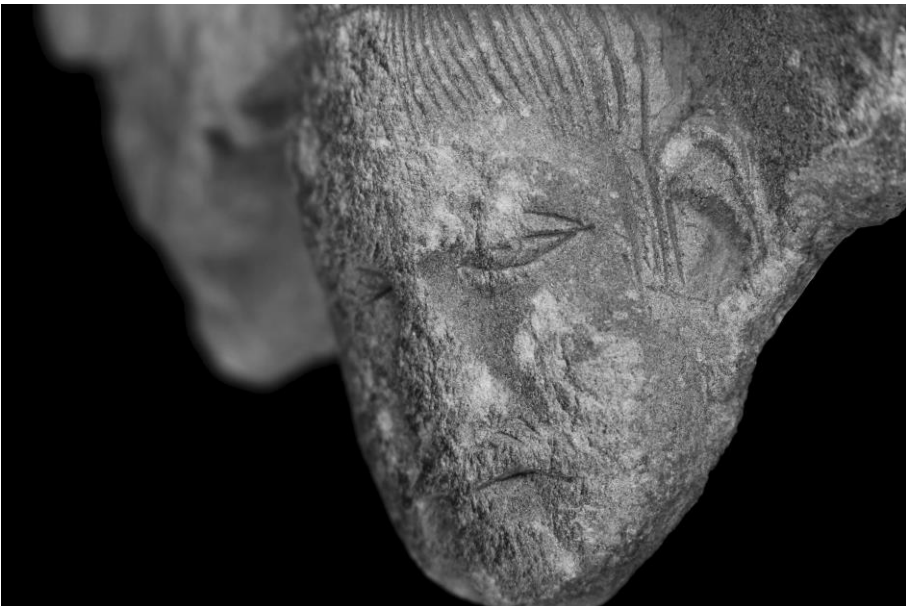
Fig. 5 – SS I 66, detail.