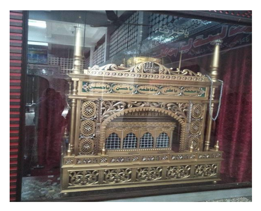
Fig. 1 - Taazia of Imam Hussain placed at Qadimi Imam Bargah, Rawalpindi.