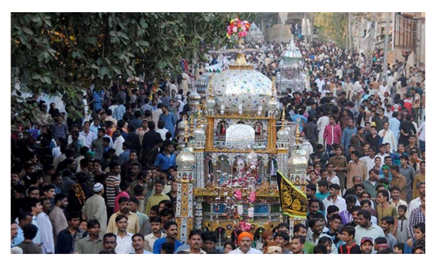
Fig. 12 -Taazia in Sindh during a Muharram Procession.<sup>62</sup>