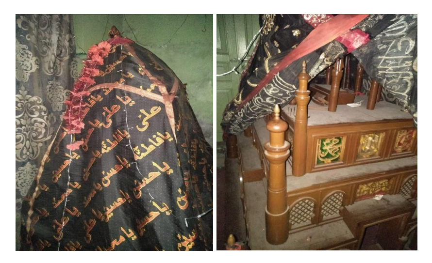
Fig. 9 - The oldest Taazia of Lahore the left. Fig. 10 - the Taazia currently taken out in Muharram each year on the Right<sup>60</sup>