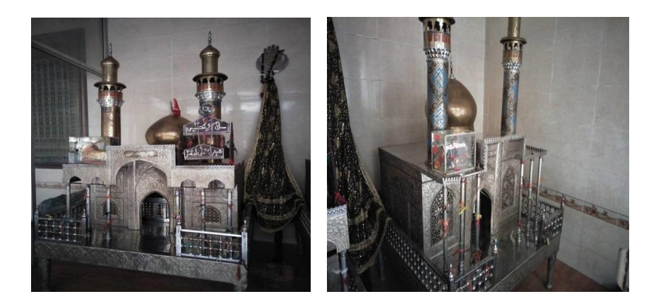
Fig. 3 - Metallic Taazia of Ali Akbar (son of Hazrat Imam Hussain) at the left and Fig. 4 - Taazia Imam Hussain on the right.<sup>56</sup>