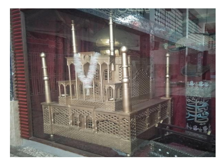
Fig. 2 - Taazia at Qadimi Imam Bargah, Rawalpindi.