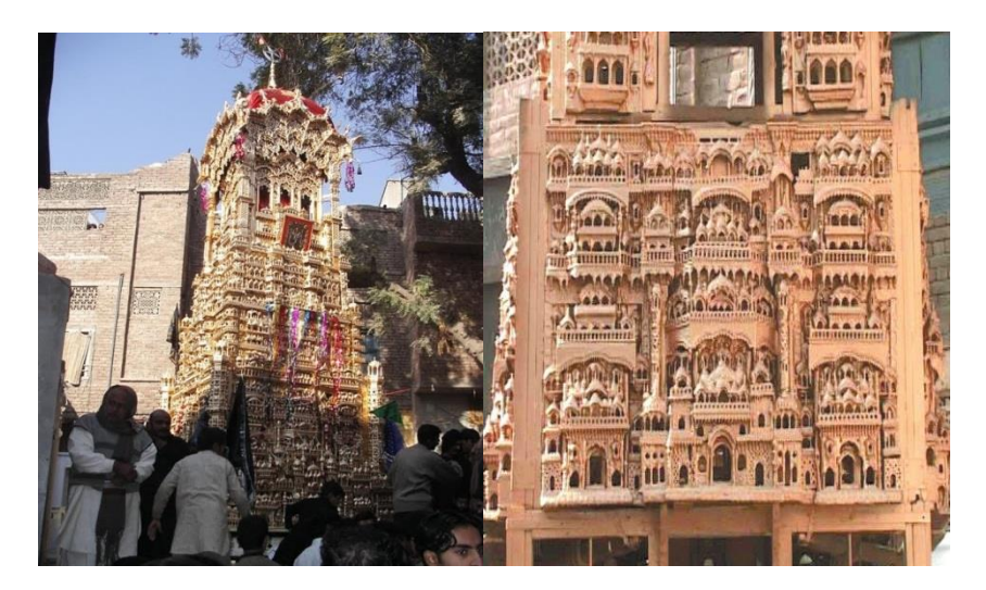
Fig. 7 - Seven Storeyed Taazia of Shagird on the left. Fig. 8 - Detailed image of seven storeyed Taazia of Shagird on the right.<sup>59</sup>