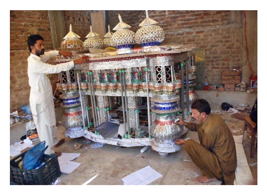
Fig. 13 - Artisans at work: Paper and Bamboo Taazia.