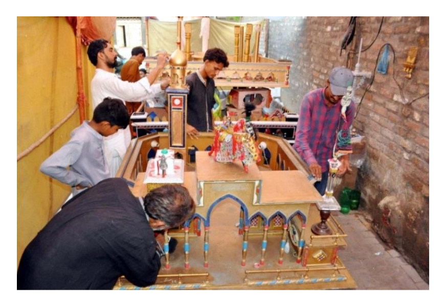
Fig. 13 - Wooden Taazia Artisans at work in Sindh.<sup>63</sup>