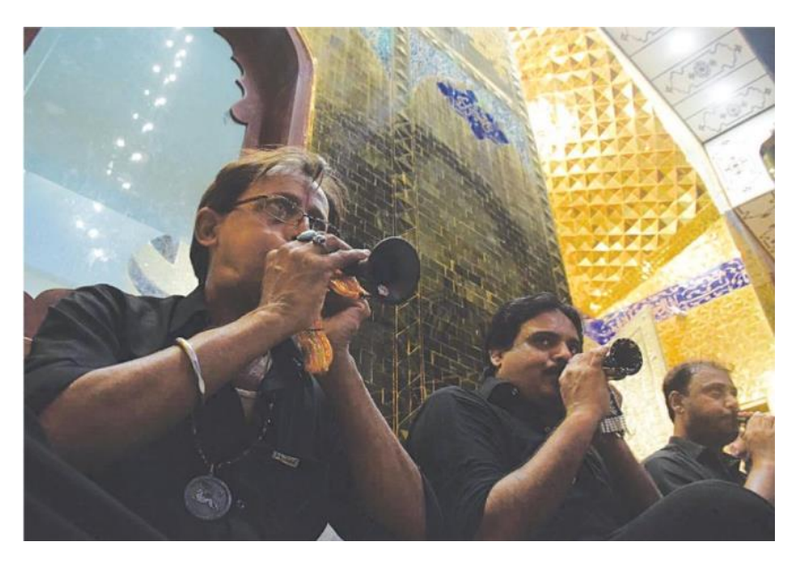
Fig. 11 -Shehnai played on elegiac tunes before Imam bargah Aliabad.<sup>61</sup>