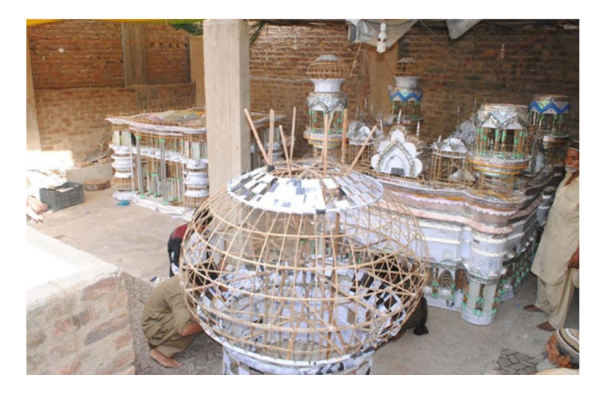
Fig. 15 - Paper bamboo Taazia making in progress.