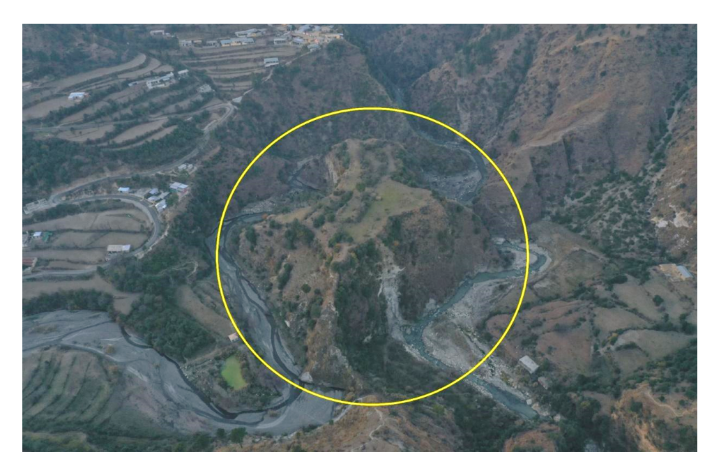
Fig. 3 - Māngal (Abbottabad); view of Mochikot site with both seasonal streams, Māngal katha from its east and Sherwan katha from west.