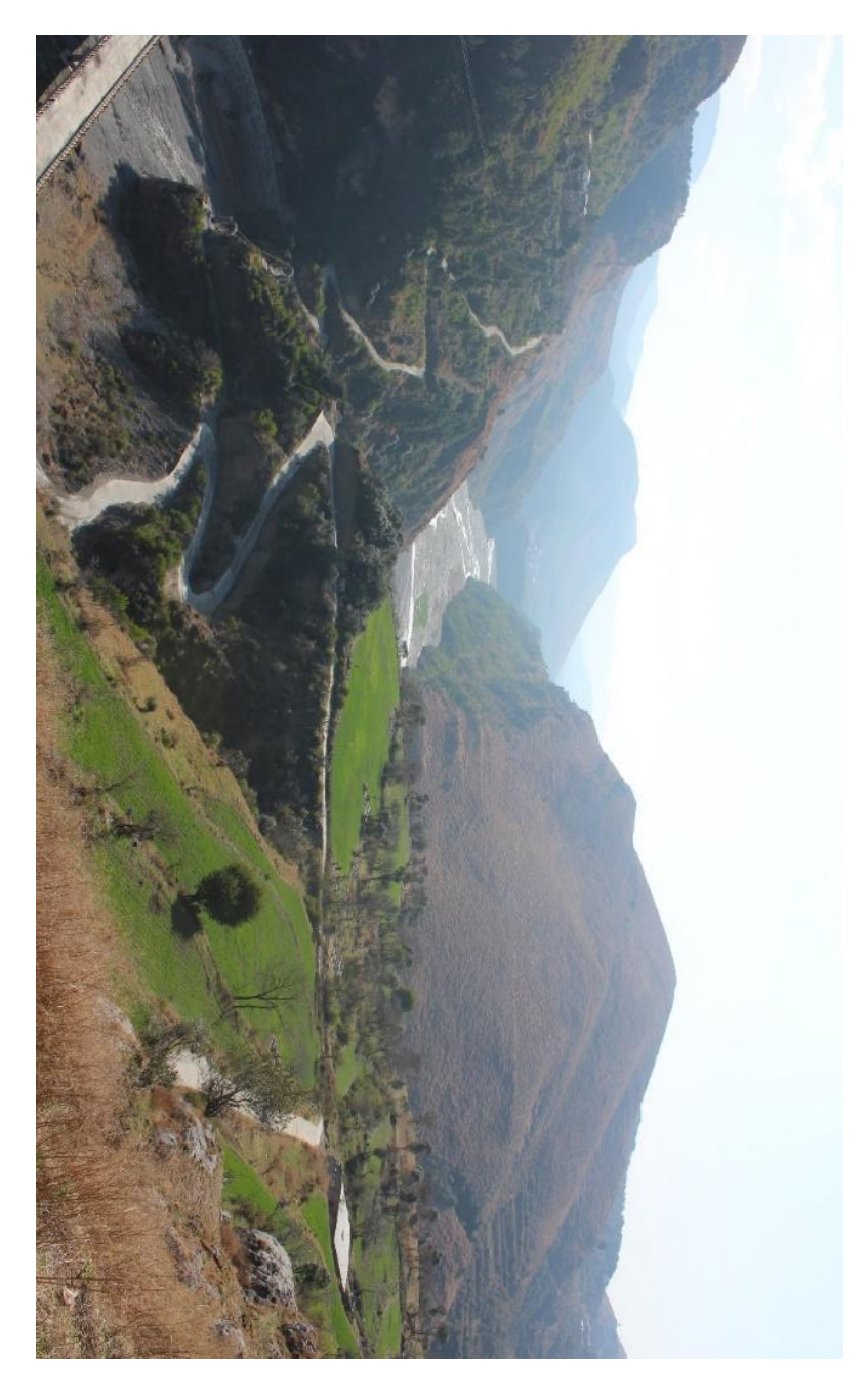
Fig. 5 - Damtaur (Abbottabad); A view of the site Damtaur (Talda sher).