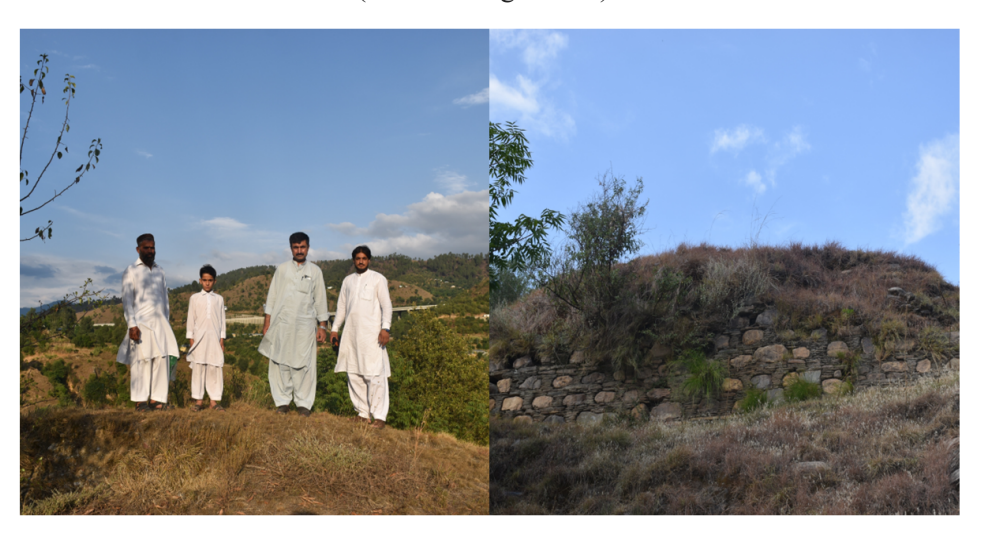
Figs 4a-b - Māngal (Abbottabad); showing the stupa wall in diaper masonry and other ruins.