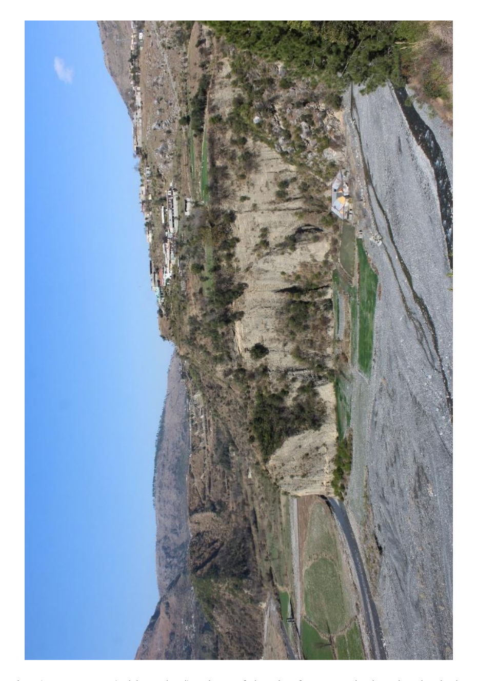
Fig. 6 - Damtaur (Abbottabad); view of the site from south showing both the rivers (khwar) Durgun and Dor (Photo by Shakirullah).