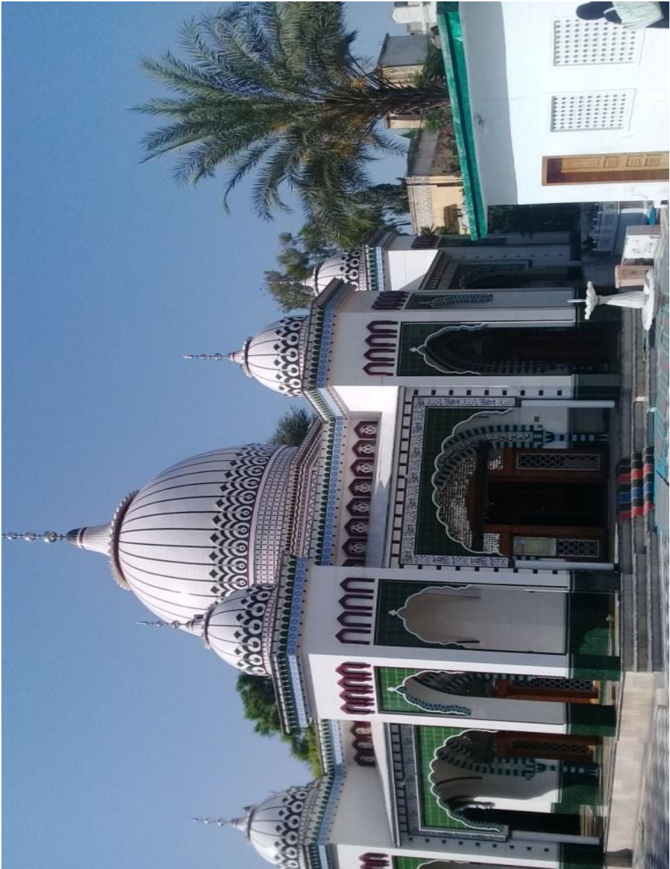
Fig. 4 - Shrine of Pir Abdul Karim Naqshbandi of Eidgah Sharif (Copyright. Mujeeb Ahmad).