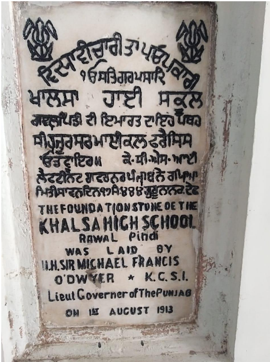
Fig.9 - Foundation stone of the Khalsa High School.