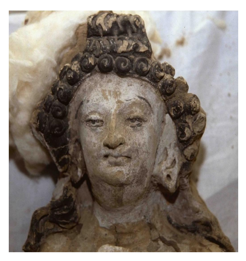
Fig. 1 - Head and torso of a female donor figure. (from Khawar [Kafir Kot], Afghanistan: Buddhist Clay-based Sculpture from the Early Period of the Śāhi Kingdoms. URL: <a href="https://shahimaterialculture.univie.ac.at/sourcebook/">https://shahimaterialculture.univie.ac.at/sourcebook/</a>)

Jibin (罽賓). There are certain difficulties with identifying Jibin. In this we agree with Shoshin Kuwayama and relate Jibin of the 8th century to Kabul, not Kapisi. As after the Turk Shahi usurpation of Kapisi, the toponym Jibin was still used but referred to Kabul (Kuwayama 1999: 60).