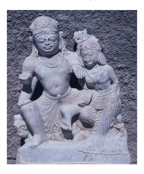
Fig. 5 - Umāmaheśvara, Tapa Skandar, 7th CE. (Photo by courtesy of The Committee of the Kyoto University Scientific Mission to Central Asia; After Shahi Kingdom Database: https://shahimaterialculture.univie.ac.at/database/).