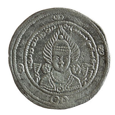
Fig. 6 – Chorasan Tegin Shah coin, Kabulistan, 7th-8th CE. (from Shahi Kingdom Database: <a href="https://shahimaterialculture.univie.ac.at/database/">https://shahimaterialculture.univie.ac.at/database/</a>).