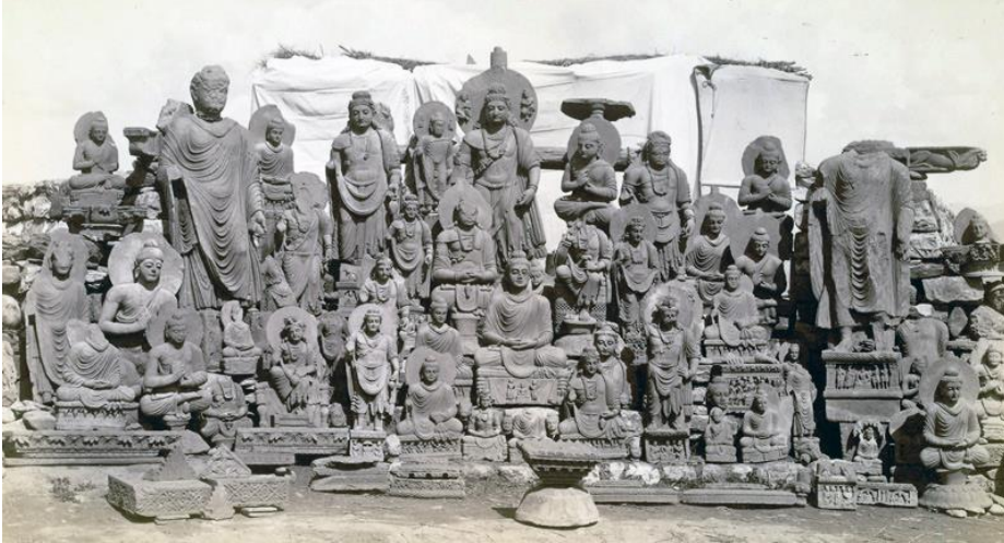
Fig. 1 - Massed group of Gandhara Buddha and Bodhisattva images collected at Lorian Tangai (Peshawar District). Photo by Alexander E. Caddy, 1896. © The British Library Board, Photo 1003/(1042) .

critique Abe 1995; Bracey 2019). The overemphasis on Graeco-Roman ‘influence,’ 1 (leading to problematic epithets such as Graeco-Buddhist, Romano-Buddhist etc.) to the exclusion of all else, resulted in a unidirectional hegemonic appropriation of Gandharan art by the European subject. These Eurocentric discourses were epistemologically informed by colonialist perspectives, essentially conveying ideas of the Western civilizing influences in South Asia. Conversely, anti-colonial and nationalistic sentiment sought to put down Gandharan artistic creativity by describing it as debased imitation of Western forms (Havell 1928, 41), stressing instead the indigenous Indian artistic innovation (Coomaraswamy 1927). The underlying assumption in these approaches was that Gandhara was a passive peripheral receiver of anything that the active Hellenistic/Roman core culture had to offer or that its art exemplified decadent impurity of foreign forms unnaturally wedded to Indian ideals (see Falser 2015). Distancing Gandharan art from unidirectional Hellenization (or for that matter Romanization) discourses as well as anti-colonial rhetoric, based on modern-day