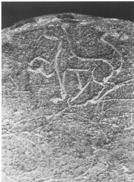
Fig. 3 - Butkara 1 panel. Chlorite-schist. (after Faccenna 1997. Inv. no. 664)