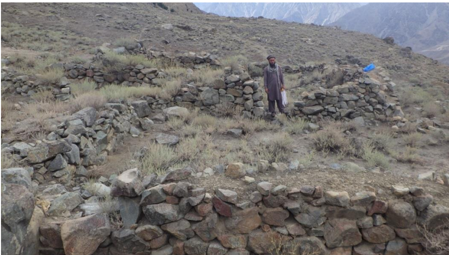
Fig. 13 - Narrow entrances to the structures, Shati Das, Shatial.

Most of the later phase structures had high standing walls with 6-8 rows of irregular stones set in mud-mortar. The walls did not show any sign of plaster on the exterior or interior surfaces. However, the interior surfaces of the walls were more aligned than the exterior surfaces, suggesting that the builders paid more attention to the interior rather than the