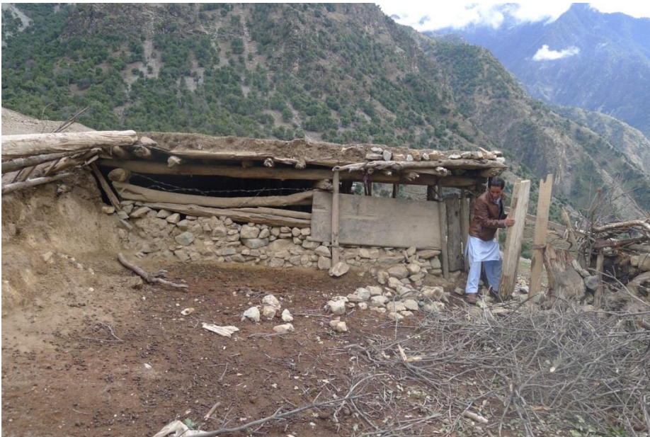
Fig. 15 - Animal enclosure at Choochang village, Dasu, Upper Kohistan.

Thus, the archaeological, ethnographic and geographic studies in the northern and north-western South Asia, indicate a long history of the continuation of the tradition of owing herds, herds management and transhumance in the region and these traditions go back to at least five thousand years. The current population of district Upper Kohistan, practicing transhumance, keep their herds of goats, sheep and cattle at specially constructed small make-shift enclosures, usually slightly away from their homes in winter villages (Fig. 15). However, they construct a simpler form of house in their summer pastures, devoting more space to the herds than their human handlers. Now-a-days, many of the families send a few members, usually comprising of young males or young couples to the summer pastures with herds and the older members of the family remain in their winter villages. This pattern is practiced in Choochang, one of the historic villages of Dasu valley in district Upper Kohistan. (pers.comm. Liqat Ali) and may or may not be the case in other parts of the Kohistan and adjoining regions.