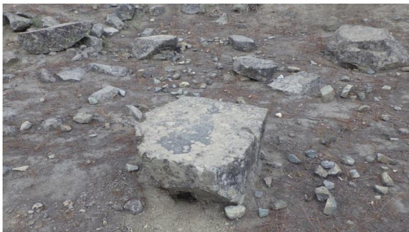
Fig. 11- Possible sacrificial stone at Shati Das, Shatial.