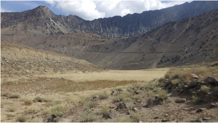
Fig. 3 - Dried-up lake 1, Shati Das, Shatial.