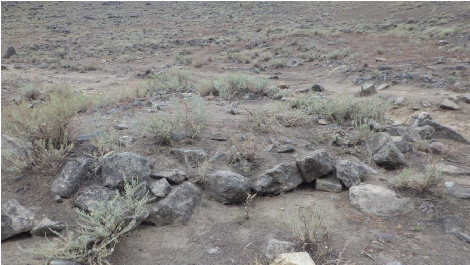
Fig. 8 - Stupa-like round structure of earliest phase, Shati Das, Shatial.

sized category of the structures, measuring 201 to 300 square metres. The extra-large and special-large-sized categories, with areas between 301 to 500 square metres and plus 501 square metres respectively, were the smallest of the groups at the Shati Das and are represented by 6 and 5 structures respectively. This means that, although, the majority of the structures at the site were less or equal to 200 square metres in area, the large, extra-large, and special-large structures were also not uncommon. It is possible that the size of the structure was defined by their function and roles in the landscape, and the creation and maintenance of social identities and statuses within the contemporary society.