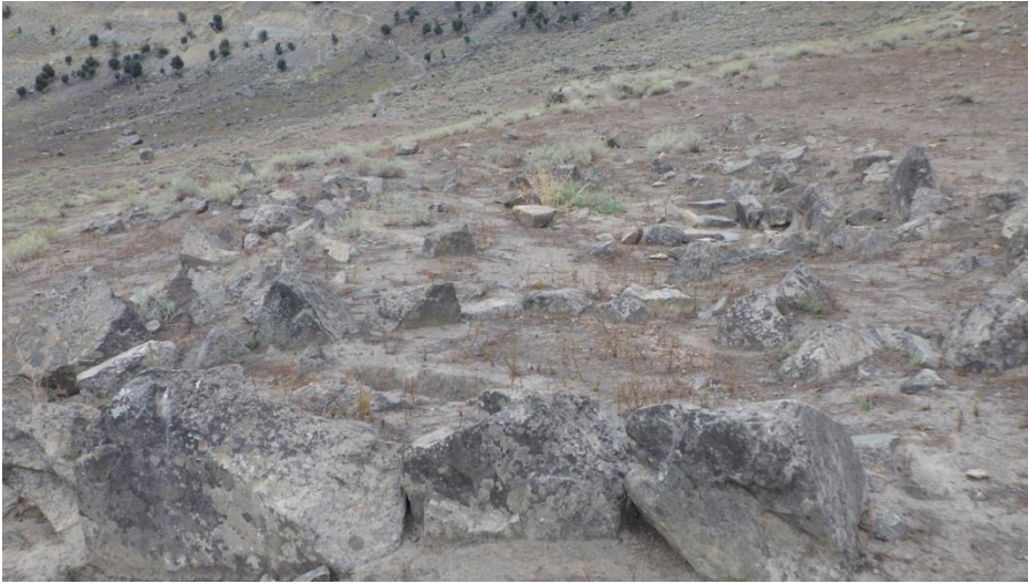
Fig. 9 - Earliest phase structures at Shati Das, Shatial.