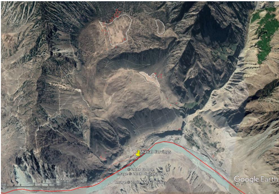
Fig. 2 - Dried-up lakes (outlined in white), transhumant structures (outlined in red) at Shati Das and Shatial carving site.

respective valleys. The lakes are currently dried; however, the locals have converted them into agricultural fields for dry farming.