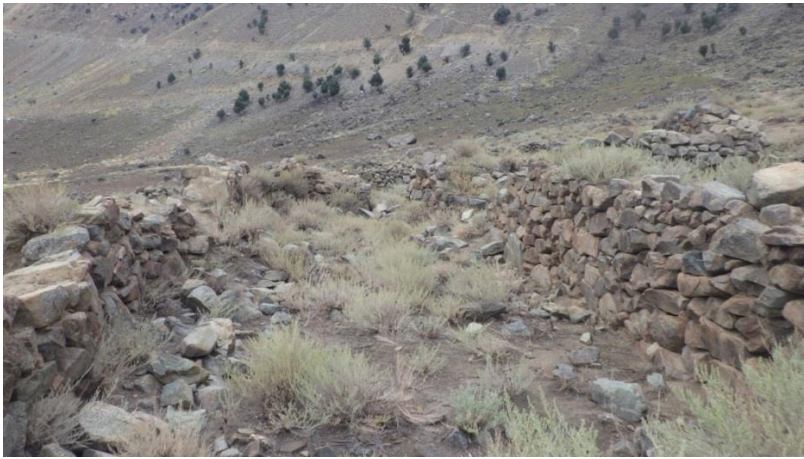
Fig. 10- Later phase structures at Shati Das, Shatial.

Taxila Valley, Vale of Peshawar and Swat Valley. Some of the potsherds had grey interiors and were provided with a yellowish/reddish wash on the exterior. The walls of the earliest phase structure were generally wider, mostly more than one metre in width, as compared to the later phase structures. At least one of the earliest structures, round in shape, seemed like the base of a stupa-like structure; however, no potsherds or broken sculpture or umbrella pieces were found in and around the structure. This structure was located on relatively higher ground near the south-eastern corner of the lake 1.