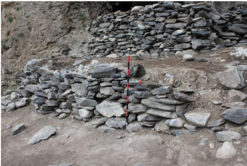
Fig.14 - Transhumant structures at Chillum Lasht Cave, Ayun, Chitral.

Coningham and Sutherland (1998), through analogy with British Iron Age storage pits interpreted the Neolithic “dwelling pits” in the Swat valley in Pakistan and Indian controlled Kashmir, and associated with the Neolithic cultures, as grain stores and linked them with transhumant groups (Zahir 2012: 29). Young (2003) and Young et al (2000, 2008) linked faunal evidence from protohistoric cemeteries and settlements in the Swat valley with those from the site of Bala Hisar, Charsadda during the 2 nd -1 st millennium BCE, and suggested a strong linkage within these sites in mountainous and plains settings respectively. Zahir (2012), through the study of the grave constructions, grave measurements, and material culture, of the protohistoric cemeteries in Dir and Swat valleys of Pakistan and Vale of Peshawar, also known as the Gandharan Grave Culture of Pakistan, suggested its connection with transhumant practices and inter-valley movement of people and possible trade links during the 2 nd -1 st millennium BCE (Zahir 2012). He also associated the grave-like structures at the site of Timargarha 3 in Dir Valley with grain stores of the protohistoric transhumant groups (Zahir 2012).