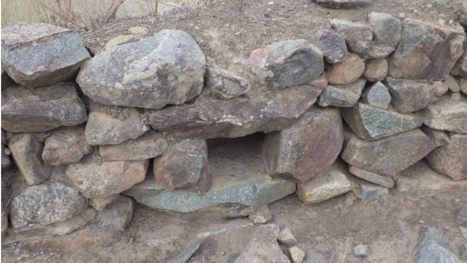
Fig. 12- Square niches in the walls of later phase structures, Shati Das.