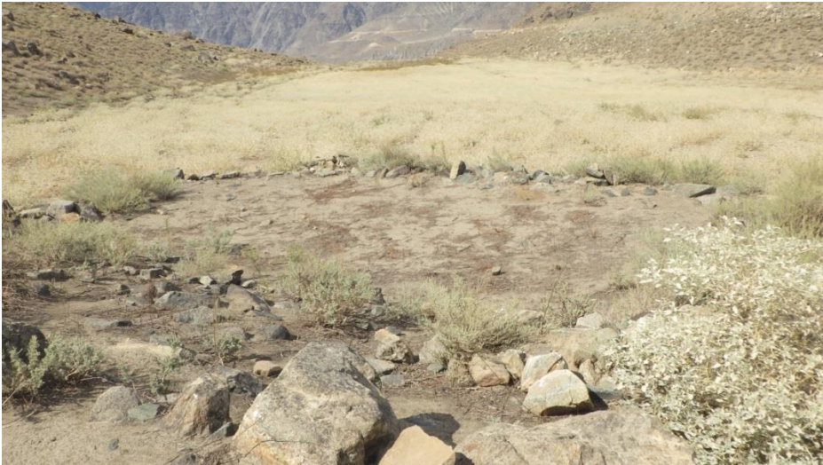
Fig. 5 - Structures along the southern edge of lake 1, Shati Das, Shatial.