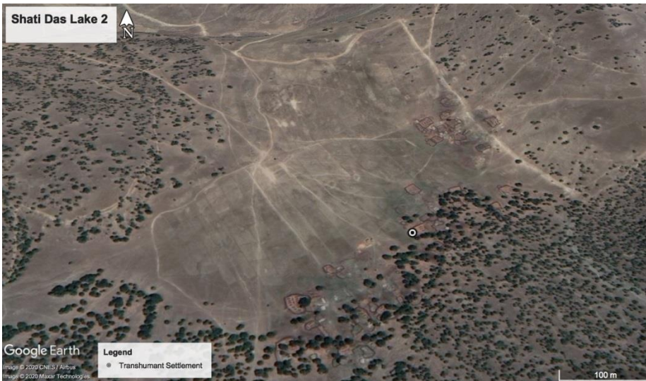
Fig. 4 - Details of settlement around dried-up lake 2 at Shati Das, Shatial (source: Google Earth Pro 2019).

The survey team, in the company of a local guide, was able to briefly visit the site on Saturday October 6, 2018. In fact, the visit lasted for about a couple of hours as the team had to return to Dasu before evening on the same day. Since then, the team has not been able to visit the site. The present report is based upon field notes, photographs and investigation through Google Earth Pro software. During the field visit, settlements were only recorded at the first lake at Shati Das; however, later investigation through Google Earth Pro revealed extensive settlements along lake 4 and other areas near Shatial rock carving site III. All the measurements for perimeter and areas of the buildings, with the exception of two, and the extent of the sites and settlements, was calculated through Google Earth Pro. Extensive settlement activities were only recorded at and around lake 1 and 2 at Shati Das (Fig. 5 and 6).