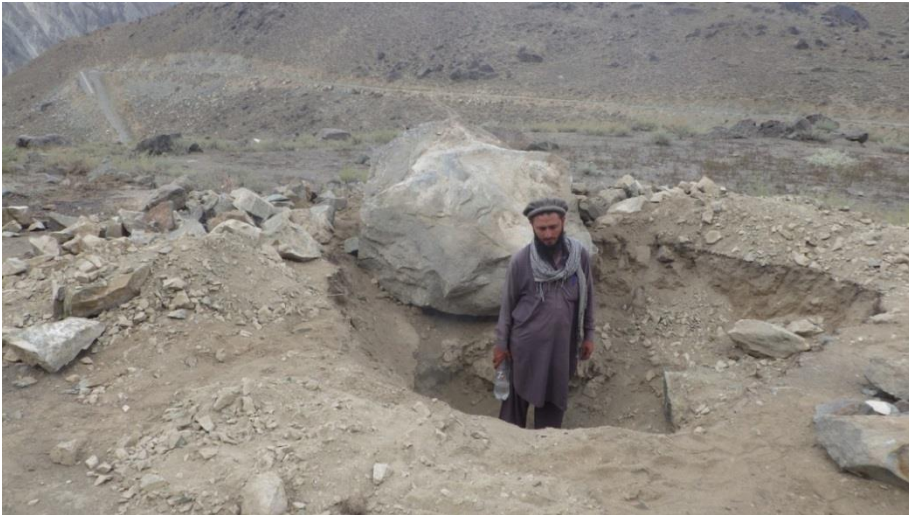
Fig.16 - Illegal excavated trenches, pointed out by our guide, at Shati Das.

derives from the rock carving sites at Shatial. The nature of the relationship between the Shatial rock carving sites, Shtial Das, and Shati Das settlement is also unknown; however, their close proximity permits the possibility of the existence of a robust and inter-dependent relationships in the past, and these settlements stand a good chance to be the corresponding, but missing, settlements with the rock carving sites. The presence of round shape stupa-like structure is probably indicative of this possibility. However, the extent of this relationship can only be accessed through multi-disciplinary research projects focusing on investigation of the landscape, systematic transect survey and proper excavations.