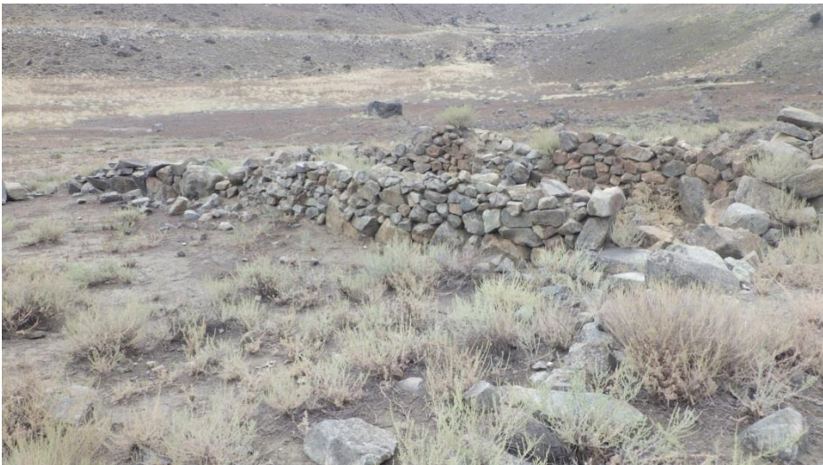
Fig. 6 - General view of the structures and lake 1, Shati Das, Shatial.