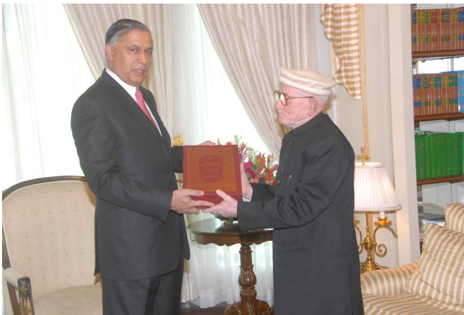
Fig. 2 - Burushaski Translation of Holy Qur'an presenting to the Prime Minister of Pakistan, Mr. Shoukat Aziz.

unique diacritical additions for fulfilling the extra phonetic requirements. More than this, he spent his seven years of life translating the Holy book of Qur'an into Burushaski for the first time, which is considered as the major contribution in Burushaski Language, and hence in recognition of this service, the then Prime Minister of Pakistan, Mr. Shaukat Aziz, invited him to the Prime Minister House to award a reward on 25th of August 2007.