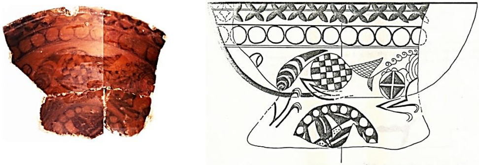
Fig. 2 - Reconstruction of a fragmentary ceramic from Qala Ahangaran, Afghanistan (After Leshnik 1967: fig. 19.).