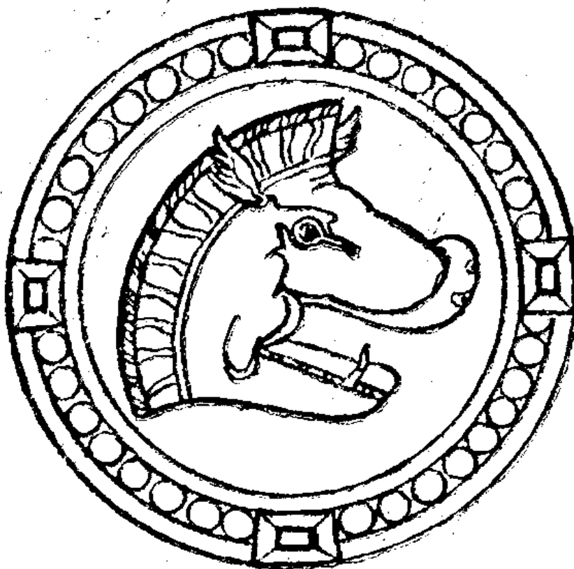
Fig. 6 - Wild boar head within pearl roundel (Bamyan/Bamiyan) (After Tarzi 1977: logo on the cover).

Every roundel contains different subjects but no wild boar heads (The Shanxi Institute of Archaeology 2004; The Datong Municipal Institute of Archaeology 2019). Sogdian pearl roundels were more elaborated than Northern Wei ones and, at this stage of our investigations, it is not yet possible to establish any clear connection between the two styles. However, it should not be underestimated the possibility that also typical decorative elements of the Northern Wei could have affected the taste of the highly mobile Sogdian merchants who, according to Chinese chronicles, were always looking for good business in their colonies and their Central Asian motherland (de la Vaissière 2005: 147-194).