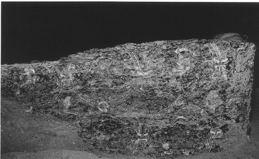
Fig. 5 - Northern Wei painted coffin embellished with pearl roundels dated to the Pingcheng period (396-494) ( After Shanxi Institute of Archaeology 2004: fig. 9).

There is enough archaeological evidence to confirm that already during the Pingcheng period (396-494) of the Northern Wei (386-534), pearl roundel patterns were popular in northern China. At least two painted wooden coffins excavated at Datong (the Northern Wei capital, nowadays in Shanxi Province) clearly present pearl roundel decorations (see Fig. 5 below).