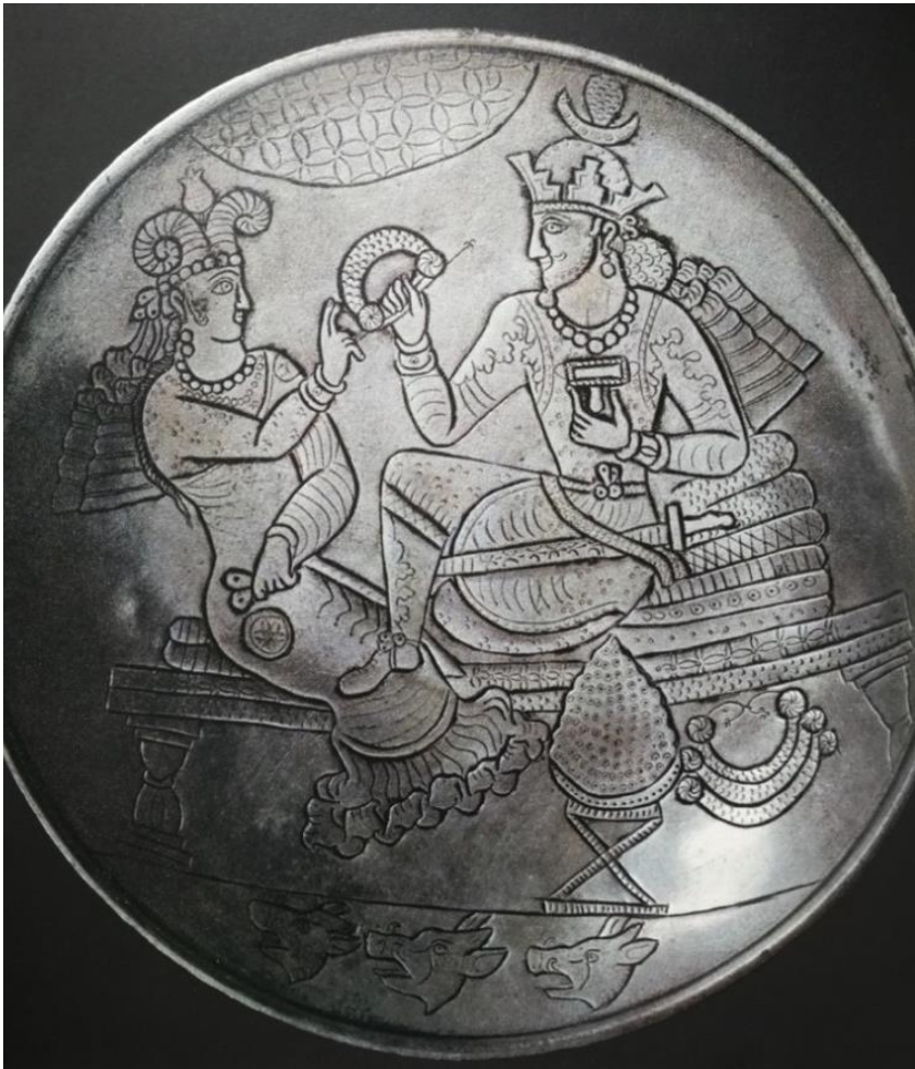
Fig. 9 - Kushano-Sasanian silver dish, Walters Art Gallery (Baltimore) (After Ghirshman 1962: fig. 259).

Only with the coming of the Arabs in Central Asia the depiction of wild boars became problematic the same as that of other “impure” animals such as pigs. Pearl roundels containing wild boar heads continued to be produced for some time in early Omayyad Iran as the chronology of Chal Tarkhan-Eshkhabad (few kilometers south of Tehran) proved to be very likely (Fig. 10) (Thompson 1976). It is, however, worth observing that the Muslims adopted other symbolic creatures from the Zoroastrians such as the so-called simurgh (Middle Persian senmurv )