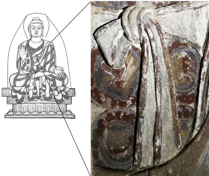
Fig. 8 - Detail of the garments of a painted statue of Buddha, main niche facing entrance, Mogao Cave 420 (Sui period).

this does not explain why only the head of the wild boar appears in pearl roundels. In other cases, scholars proposed to associate Verethraghna with the (winged) camel or the falcon in Central Asian arts because, according to the Avesta, this deity manifested himself also as these animals.