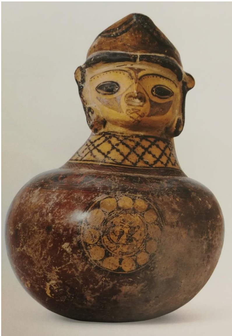
Fig. 4 - Human-shaped jar kept in the Khalili Collection (After Catalogue Paris 2009: cat. 23).

According to the catalogue entry, this jar would be a product of eighth-tenth century eastern Iran or Central Asia (Catalogue Paris 2009: cat. 23).