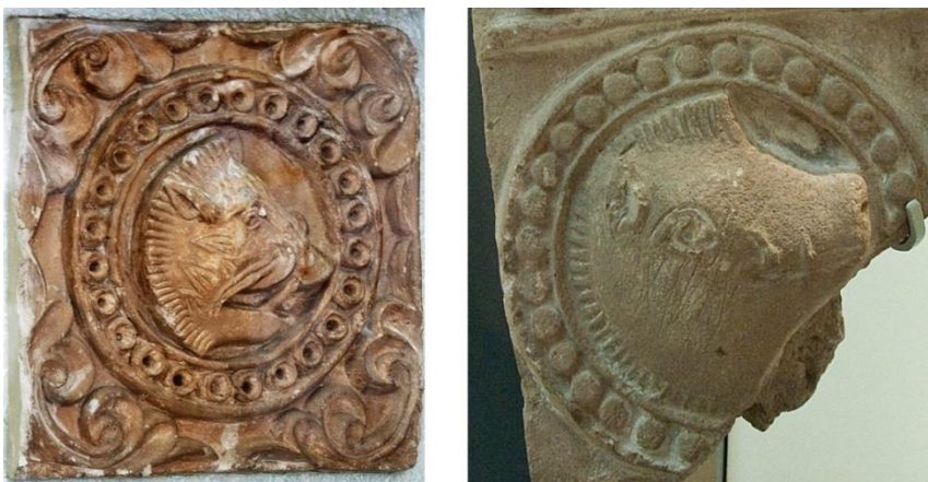
Fig. 10 - Left: stucco decoration from the palace of Tepe Hisar, Damghan (Iran Bastan, Tehran). Right: Chal Tarkhan/Eshkhabad (British Museum, London) (Photos: Courtesy by Daniel Waugh).

Strangely enough, Central Asian Buddhists who appreciated the wild boar head motif did not adopted the so-called simurgh or, better, pseudo- simurgh . Not one single textile nor painting embellished with the pseudo- simurgh was found during scientific (nor illegal) excavations in Bactria-Tokharistan, Bamyan, the Tarim Basin, and the rest of Buddhist Central and East Asia. Even though the reason for the Buddhist repulsion for such a decorative motif is completely unknown, this attitude could be considered instrumental to suggest better chronologies for many Central Asian artifacts, especially unexcavated ones that always constituted a great problem for experts and curators of public and private collections (Compareti 2020). One pottery shred from Afghanistan was proposed to be reconstructed as including a pseudo- simurgh within a pearl roundel by Piggot (fig. 1). This is not a surprise since pseudo- simurghs were very common in early Islamic art and copper coins (Compareti 2019).