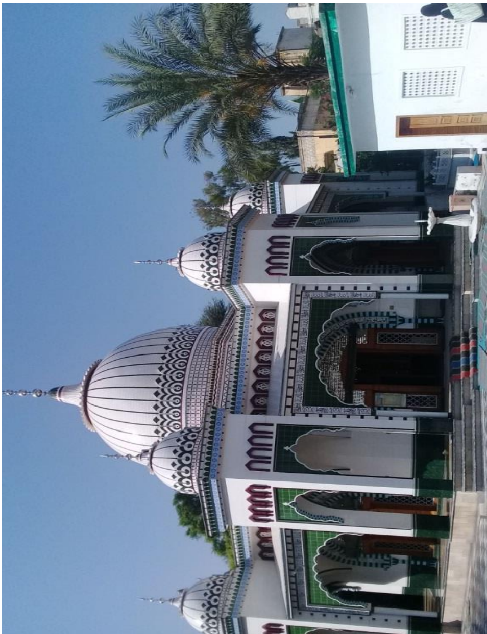
Fig. 4 - Shrine of Pir Abdul Karim Naqshbandi of Eidgah Sharif (Copyright. Mujeeb Ahmad).