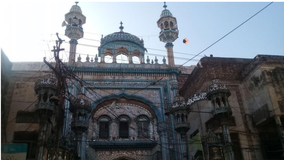
Fig. 2 - Main Entrance Gate of Markazi Jamia Masjid (Photo by Mujeeb Ahmad).