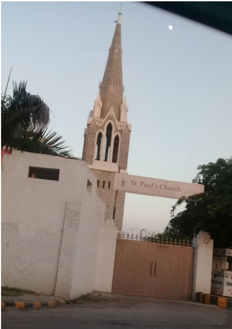
Fig. 5 - Main Entrance of St. Paul's Gothic Church, The Mall.