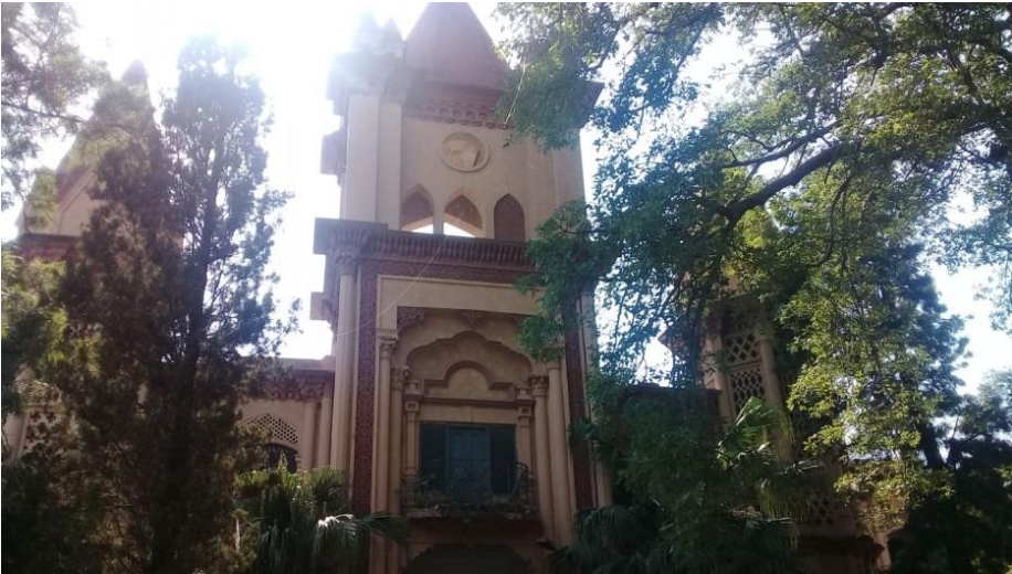
Fig. 11- Main Building of Government College.