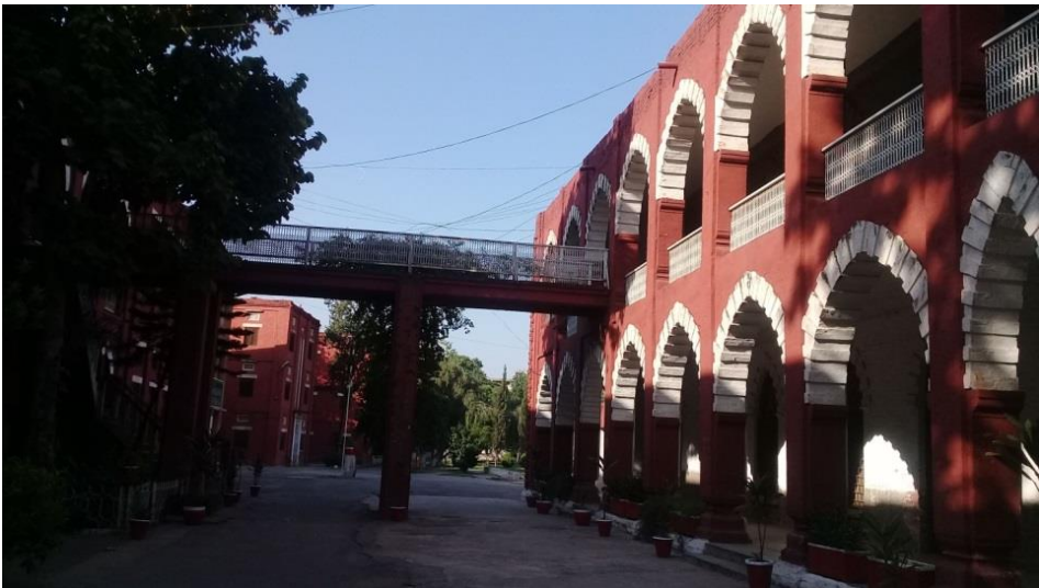
Fig.8 - A View of Gordon Collge.