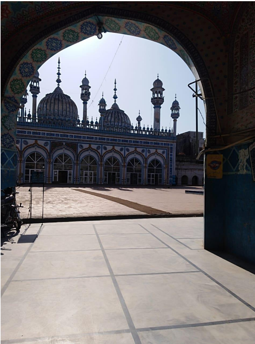
Fig.3. Front View of Markazi Jamia Masjid.