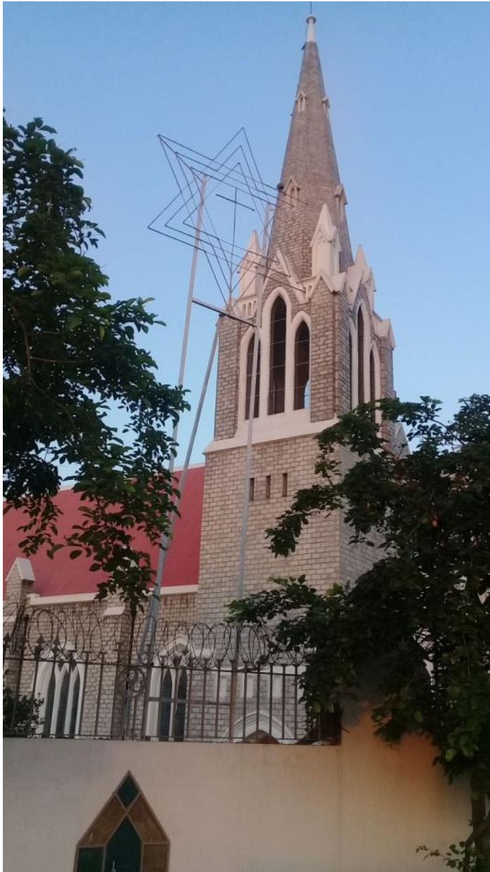
Fig. 6 - A View of St. Paul's Gothic Church, The Mall.