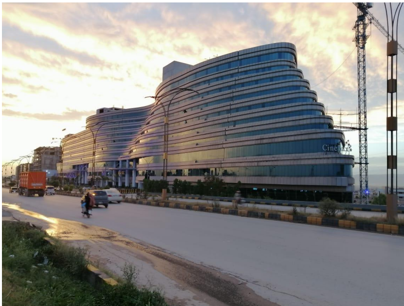
Fig. 16 - Modern Architecture.