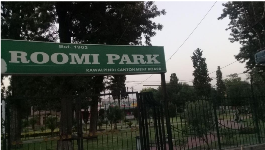
Fig. 14 - Rumi Park.