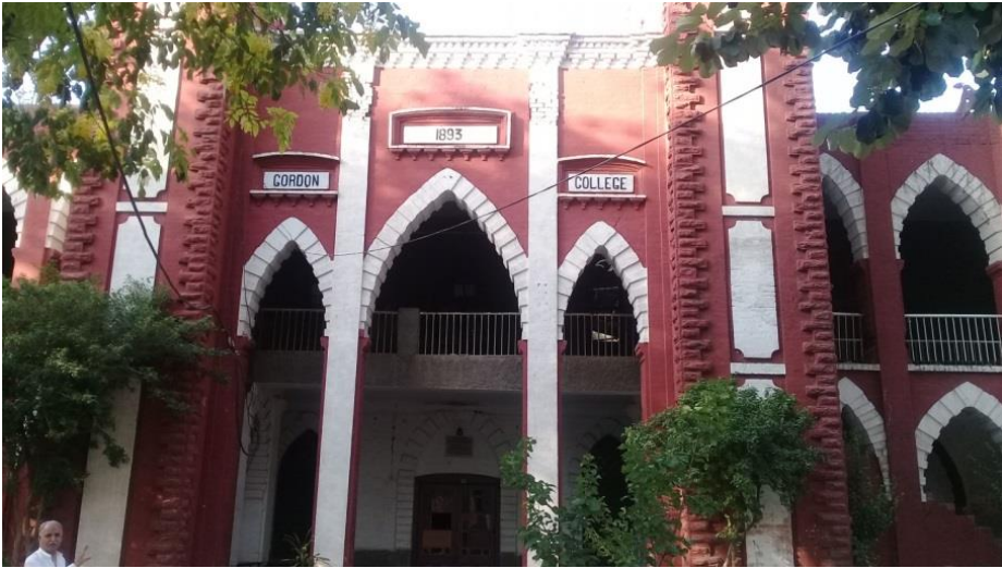
Fig.7 - Main Buiding of Gordon College.