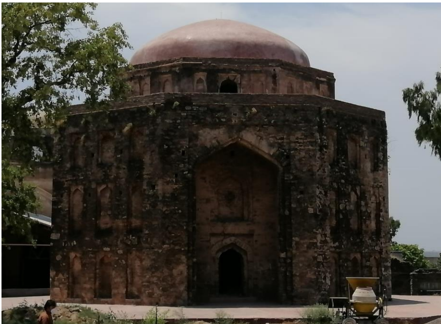
Fig. 12 - Mausoleum of Sultan Sarang Khan.