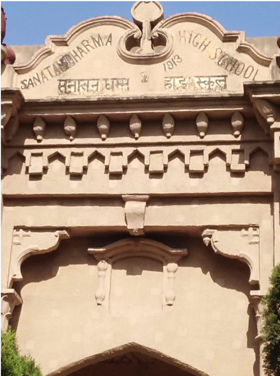
Fig. 10 - Building of Sanatan Dharma High School.