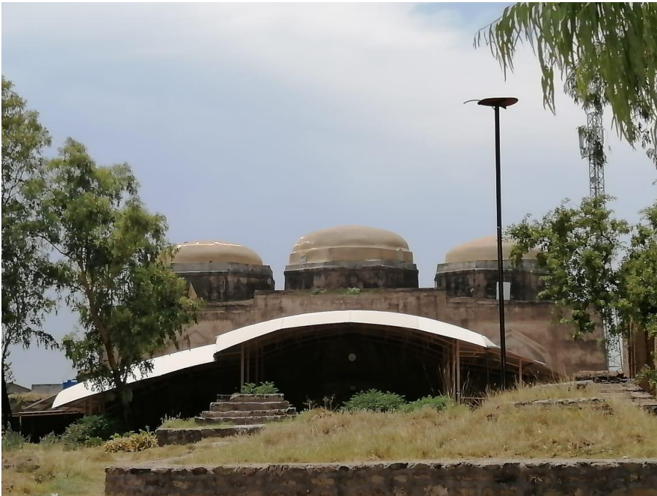
Fig. 13 - Three-domed mosque.