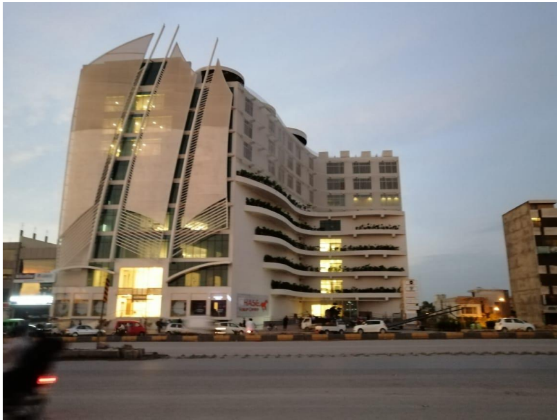
Fig. 15 - Modern Architecture (Photo by Mujeeb Ahmad).